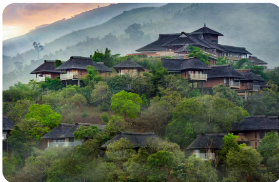
Winner of The Economic Times Designscape Awards 2025 in Hotel Architecture CategoryArchitects: Idea Design, Kochi