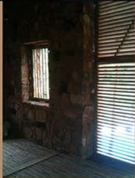
Mezzanine Bamboo Floor