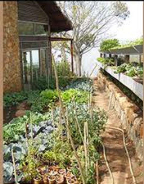
Organic Vegetable Garden