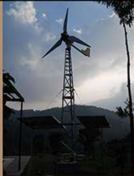
Wind & Solar Energy