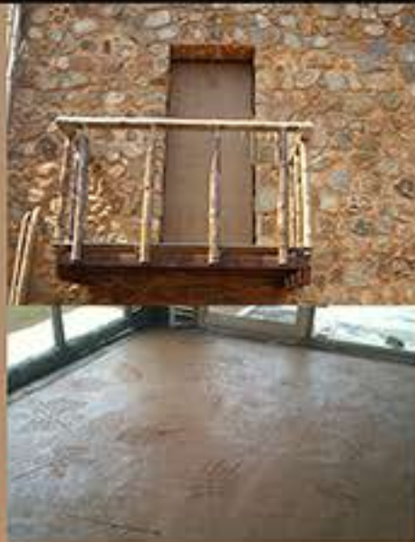
Stone Wall, Balcony & Mud Floor