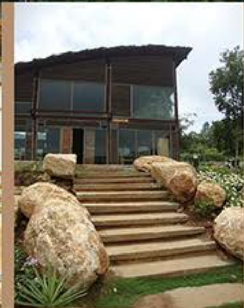
Entry through Stepping Stones